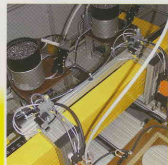
Two head automatic stud feed system with bowl feed