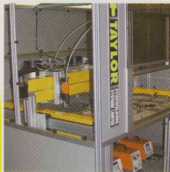
CNC system welding 2 components simultaneously