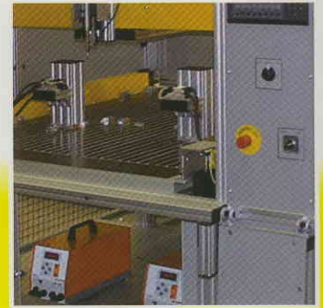
Large weld area, special jiggling, high speed controllers – increases production and lowers costs