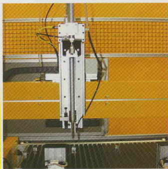
Special autofeed weld head designed to weld into boxes 300mm deep