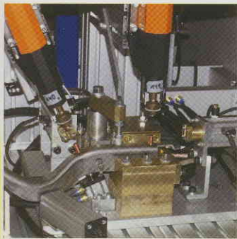
Dual head facility enables simultaneous welding of studs

At Taylor Studwelding we offer customers a full turnkey operation. We analyse your needs, offer professional advice and supply the specialist systems that provide you with the Taylormade solution. No matter whether it's handheld, lightweight units or fully automated CNC and robotic Studwelding systems, Taylor Studwelding can meet your needs.