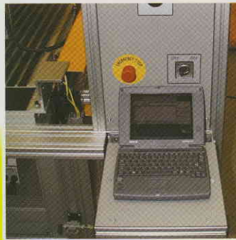
Off-line programming from any suitable computer system